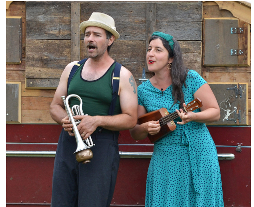
Modern Times Theater at GFL in July.