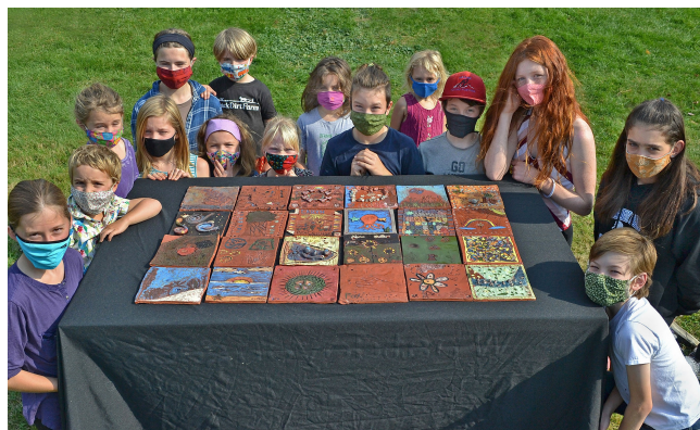
Students with tile mosaic.

Thank you to WonderArts for partnering with GFL on this project.